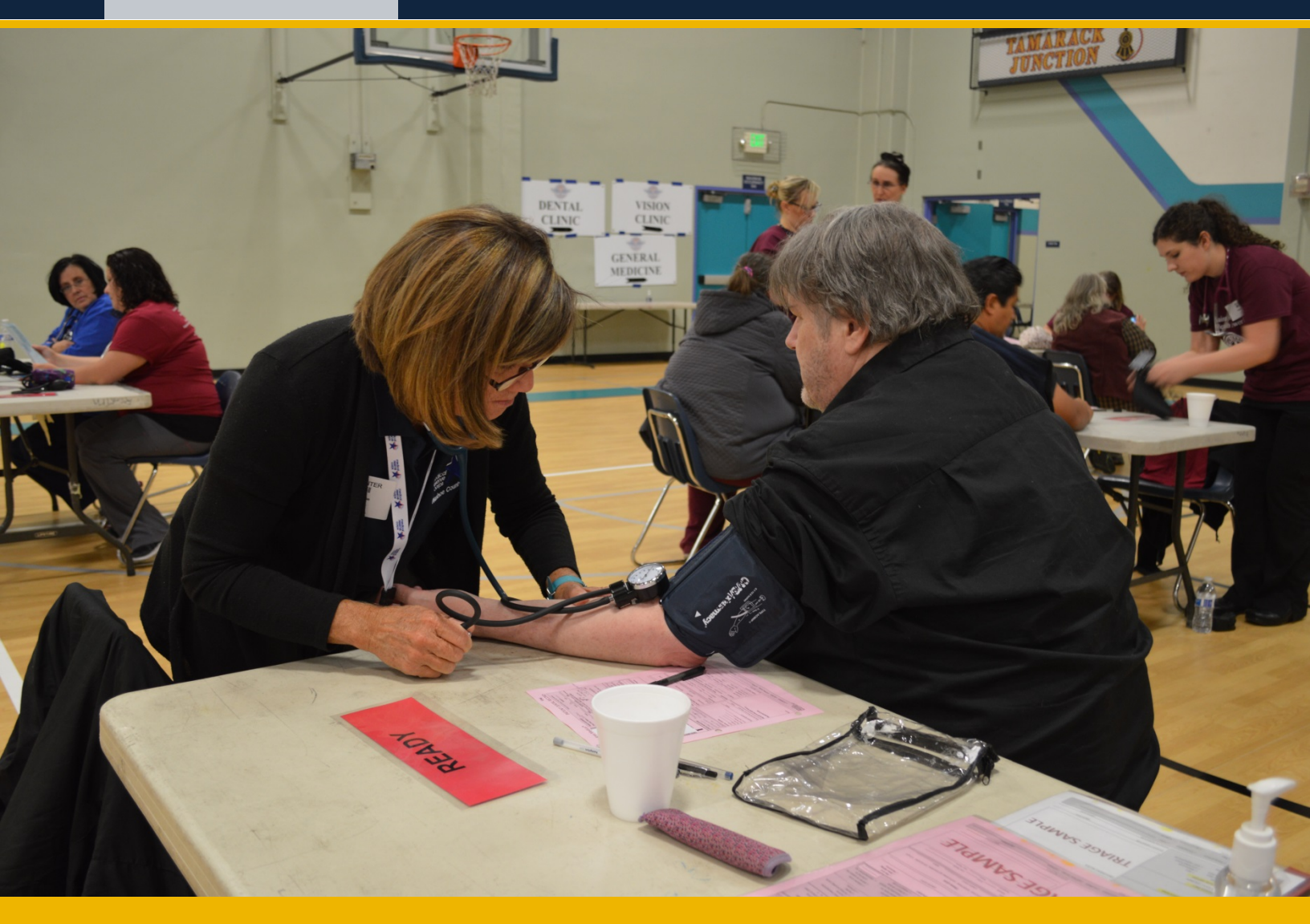
In Partnership with